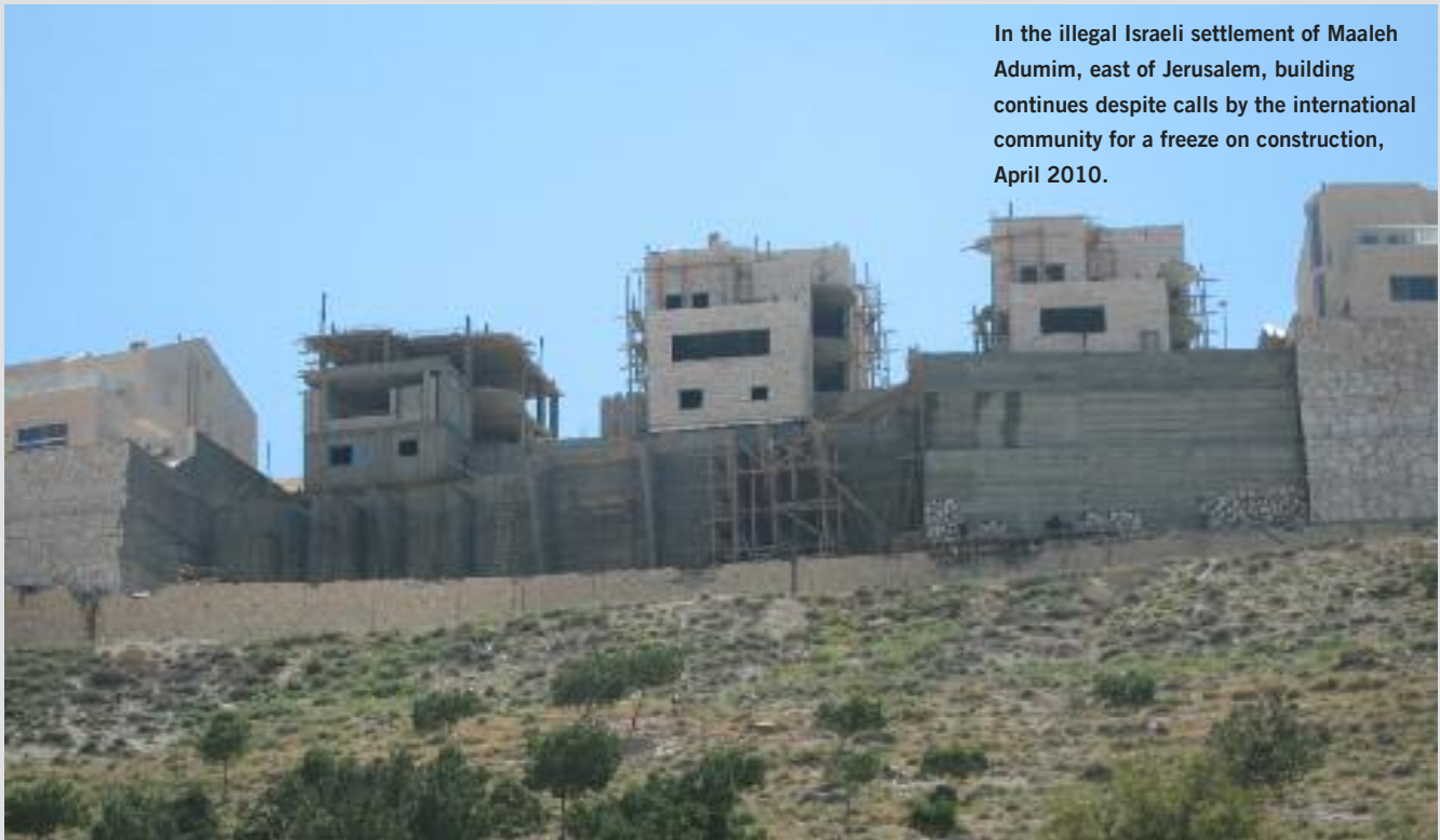
In the illegal Israeli settlement of Maaleh Adumim, east of Jerusalem, building continues despite calls by the international community for a freeze on construction, April 2010.